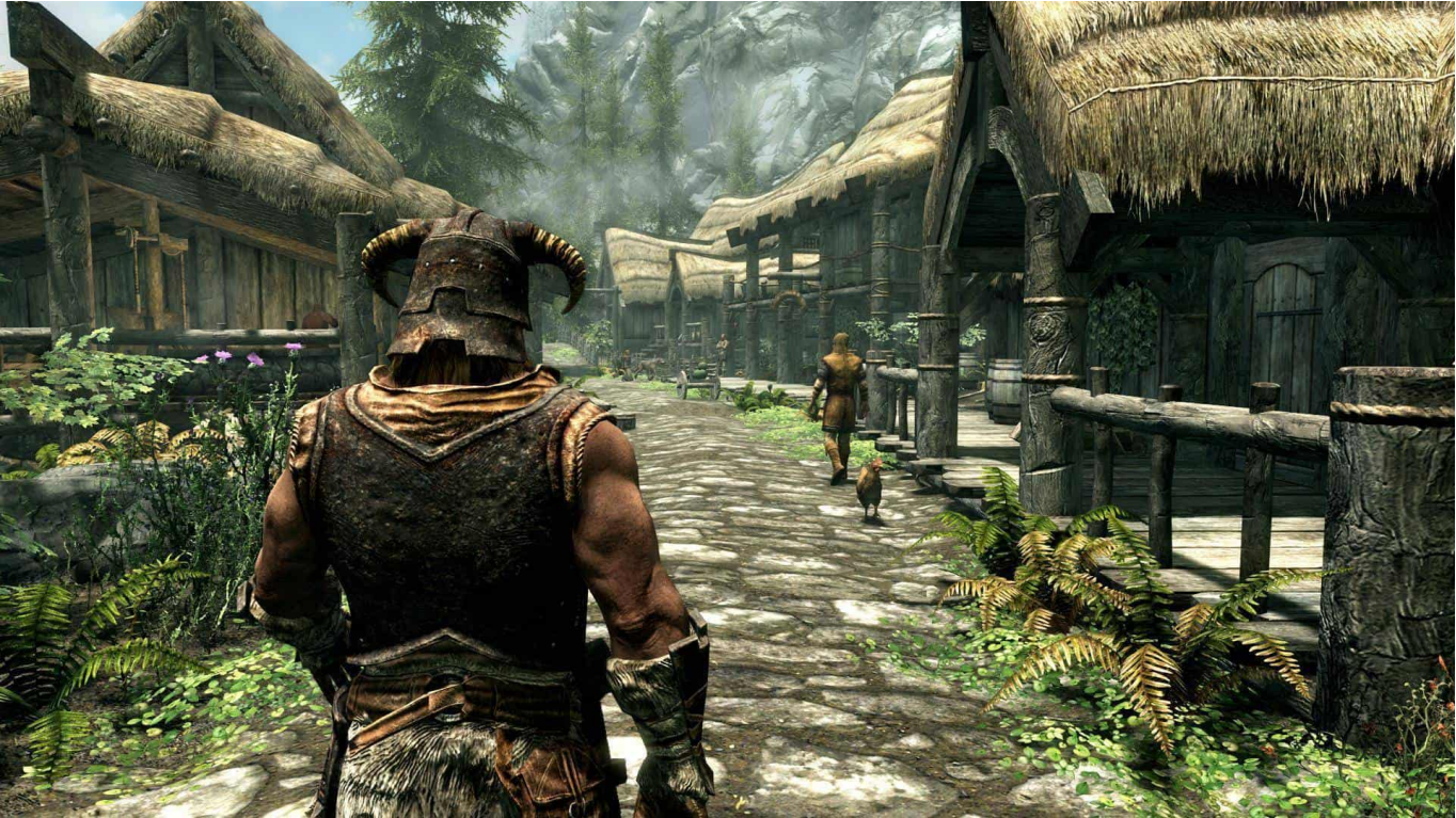
Skyrim Bows Do More Sneak Dmg Mod